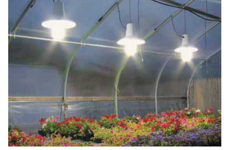
Reflectors enhance light emission and increase coverage area, reducing the number of required fixtures.

Some LED light fixtures are specifically designed for horticultural applications and can provide adjustable red, white and blue light with balance knobs to allow for spectral control. This is ideal for those who need precision